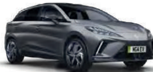
CAMDEN GREY METALLIC*