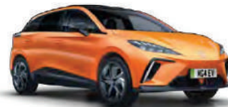
VOLCANO ORANGE PREMIUM**^