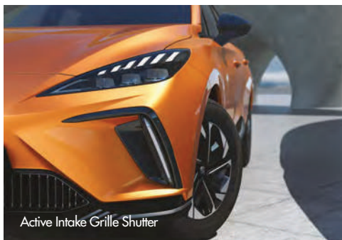
Active Intake Grille Shutter