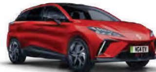
DYNAMIC RED TRI-COAT*

*Metallic, tri-coat and premium paint optional at extra cost. ^Trophy Long Range only.