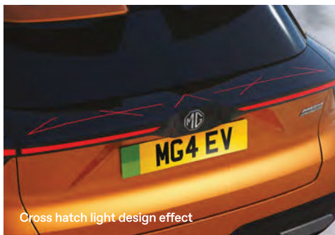
Cross hatch light design effect