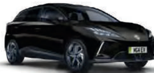
BLACK PEARL METALLIC*