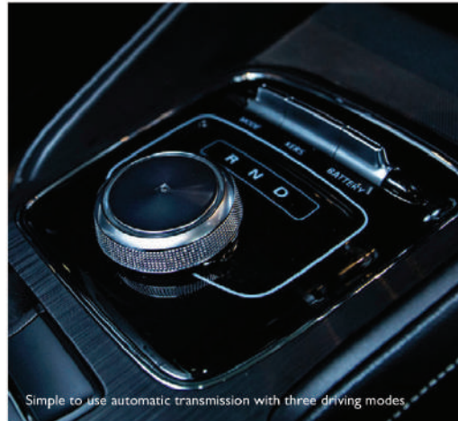
Simple to use automatic transmission with three driving modes