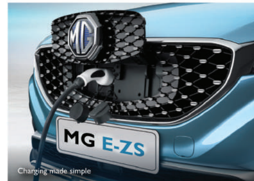
Charging made simple