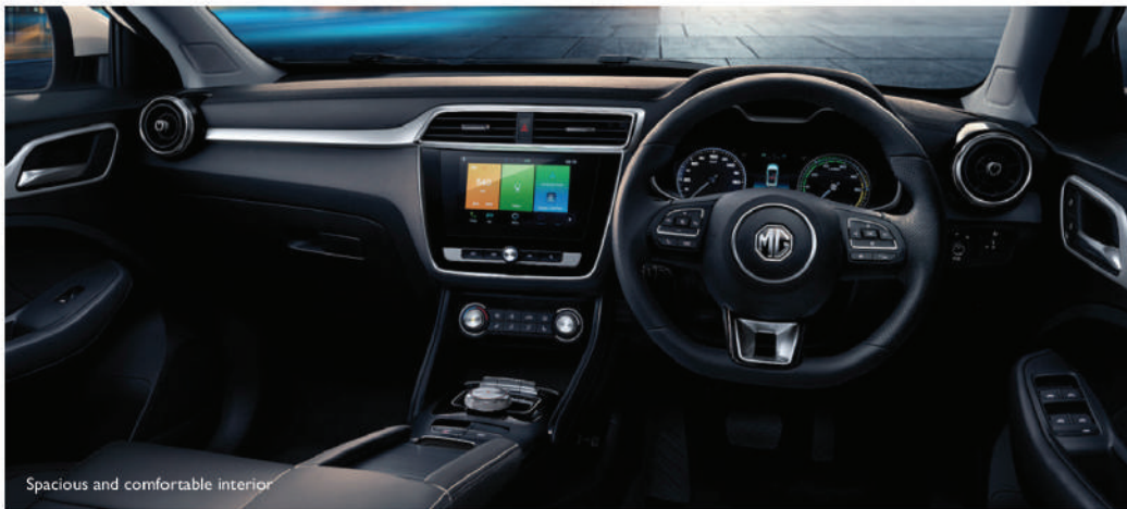
Spacious and comfortable interior