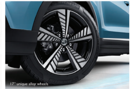
17" unique alloy wheels