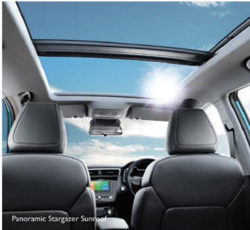
Panoramic Stargazer Sunroof