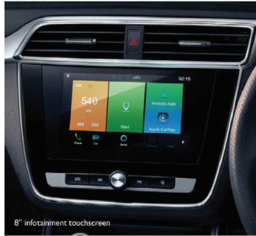
8" infotainment touchscreen