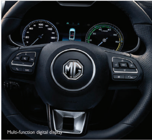
Multi-function digital display